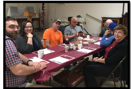
The annual Vince Gentilini Polenta Feed was held Sunday, April 24 at the Buhl Senior Center. The Event was attended by 31 Trentini and friends.